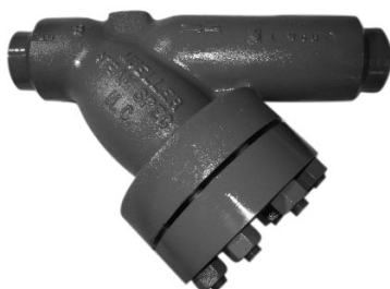
Models 764WE, 765MWE, 766MWE, 767WE