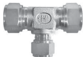
Fractional fitting shown