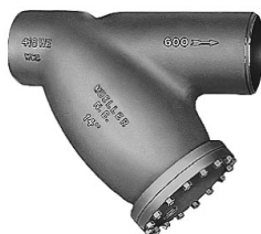
Models 764, 765, 765M, 766, 766M, 767

764 Class 600 765M Class 900 766M Class 1500 767 Class 2500