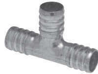
PB611 Tee – Barb x Barb x Barb