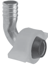
PB607-FA 90° Elbow Faucet Connector – Barb x Swivel FIPS