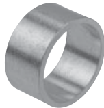
PB198 Crimp Ring – Copper