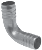
PB607 90° Elbow – Barb x Barb