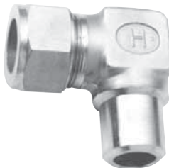
Metric fitting shown