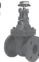
F-619-SO Flanged With Square Op. Nut