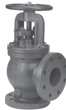
F-869-B Flanged Series D

* With proper machining facilities available. Valve must be installed vertically.