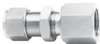
Metric fitting shown