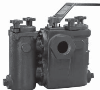
Models 792SH, 794SH

Strainers provide economical protection for costly pumps, meters, valves, and other similar mechanical equipment by straining foreign matter from the connected piping system. Installation of a strainer before mechanical equipment can ensure trouble free service and avoid costly shutdowns for repair or replacement of equipment damaged by foreign matter. The size of the perforation or mesh in the basket screen will determine the smallest particles captured. See pages Strainer Information section of the Mueller Steam Specialty Engineering binder for detailed information including sizes and materials available.