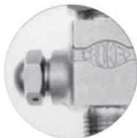
2466L84Y with spring relief