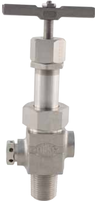
2464L84Y with rupture disc

2400 Series 316 stainless steel, forged body angle pattern valves, come with a union bonnet for increased safety and ease of maintenance.