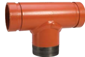
FIGURE 320 GROOVE X MALE THREAD TEE FABRICATED