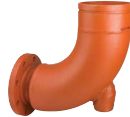
FIGURE 316 REDUCING BASE SUPPORT ELBOW GROOVED X FLANGED FABRICATED