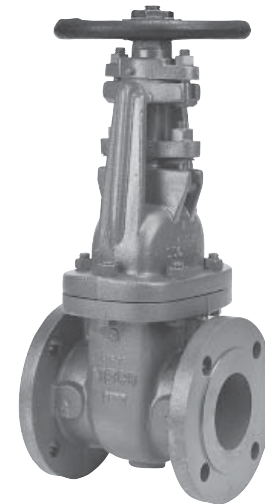
F-637-31 Flanged-Raised Face