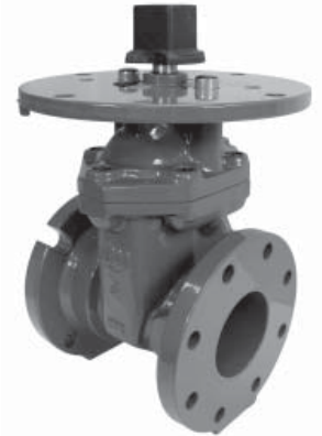
FM609-RW Flanged x Mechanical Joint

UL/ULC LISTED • FM APPROVED • AWWA C509 & 515