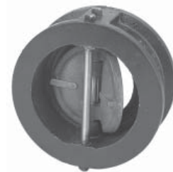
KW-900-W Wafer Style 14" - 16"

NOTE: Twin Disc Check Valves can be installed horizontally or in the vertical position with flow up.