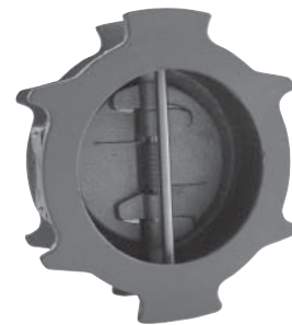
KW-900-W Wafer Style 2 1/2" - 12"