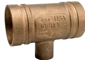
FIGURE 618 REDUCING TEE GROOVE X GROOVE X CUP CAST

Please refer to General Notes on page 17.