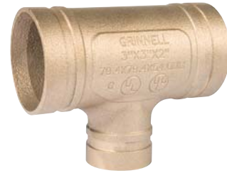
FIGURE 621 REDUCING TEE GROOVE X GROOVE X GROOVE CAST

Dimensional information in this chart is for cast fittings.