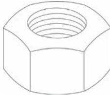
Dimensions • Weights

Order By — Figure number size and finish