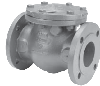
F-938-31 Flanged-Raised Face