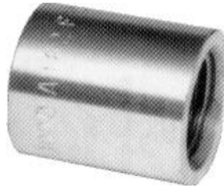
PENN CATALOG F2002 FIG NO. 03009 ASME-B16.11-2001