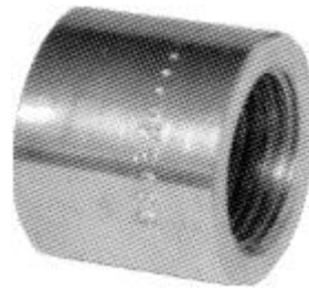
PENN CATALOG F2002 FIG NO. 03010 ASME-B16.11-2001