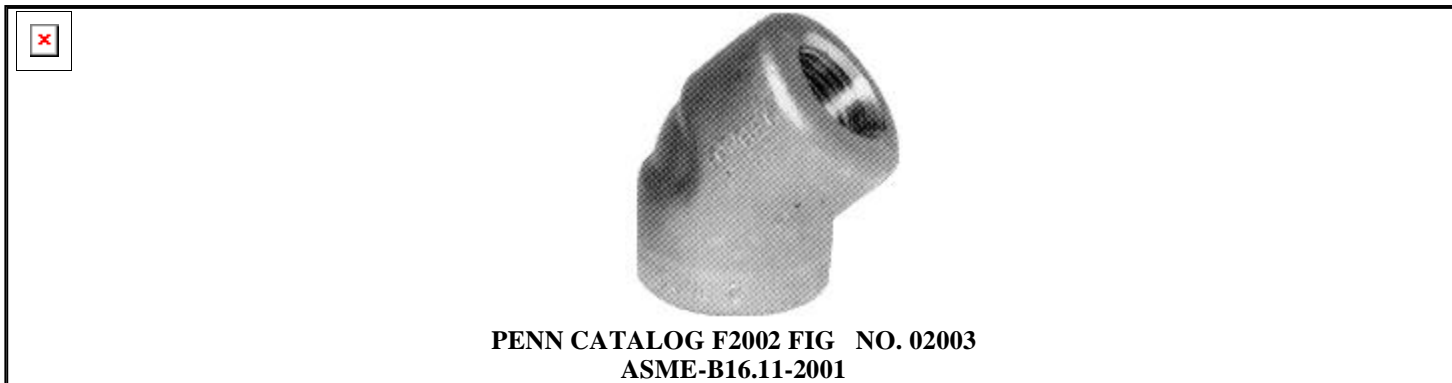
PENN CATALOG F2002 FIG NO. 02003 ASME-B16.11-2001