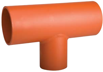
Figure 921 Reducing Tee