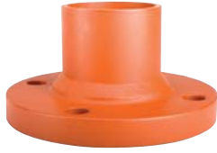
Figure 941 Plain End x Class 150 Flange