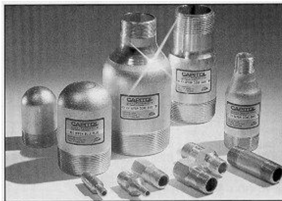
Seamless Bull Plugs