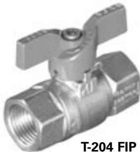
T-204 FIP x FIP T-Handle