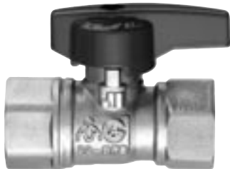
T-204 FIP x FIP Teardrop Handle