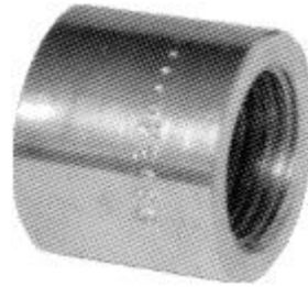
PENN CATALOG F2002 FIG NO. 06010 ASME-B16.11-2001