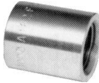
PENN CATALOG F2002 FIG NO. 06009 ASME-B16.11-2001