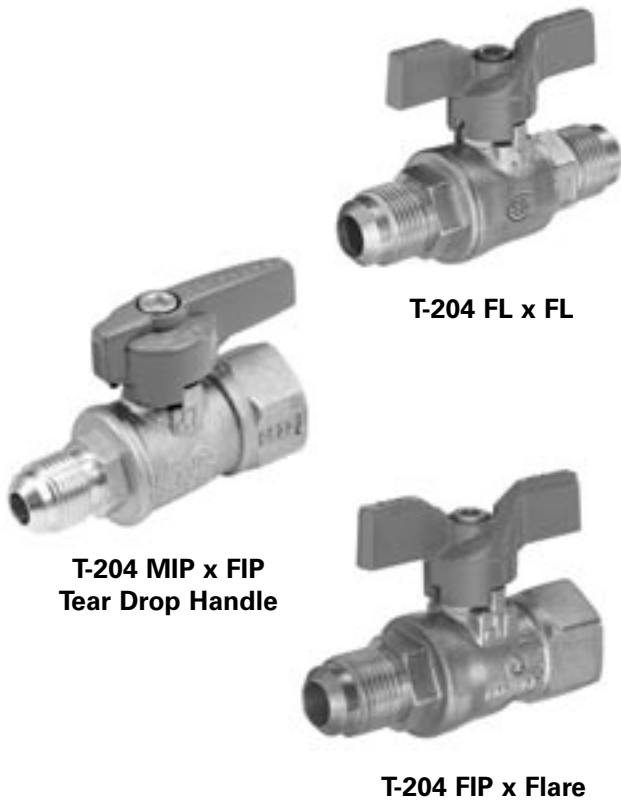
T-204 FL x FL

The Company, for a period of one year from the date of shipment, warrants each product or system of its own manufacture to the original purchaser to be free from defects in material and workmanship under normal use, service and maintenance.