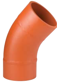
Figure 901LR 45° Elbow Long Radius