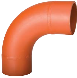
Figure 910LR 90° Elbow Long Radius