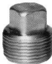
PENN CATALOG F2002 FIG NO. 06013 ASME-B16.11-2001