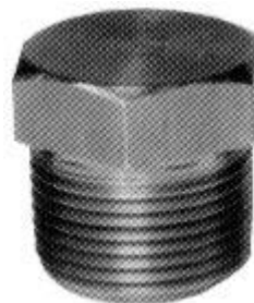
PENN CATALOG F2002 FIG NO. 06014 ASME-B16.11-2001