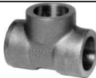
PENN CATALOG F2002 FIG NO. 13002 ASME-B16.11-2001

Click here for the reducing fitting correct ordering practice