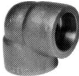
PENN CATALOG F2002 FIG NO. 13001 ASME-B16.11-2001

Click here for the reducing fitting correct ordering practice