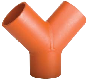
Figure 924 90° True Wye