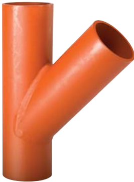
Figure 914 45° Lateral