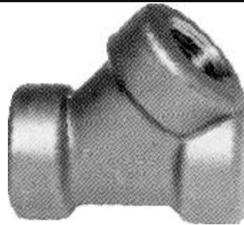
PENN CATALOG F2002 FIG NO. 06006

Click here for the reducing fitting correct ordering practice