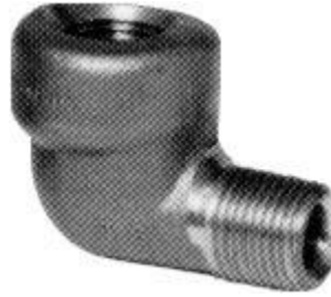
PENN CATALOG F2002 FIG NO. 06005