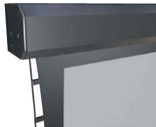
Luxus Model A