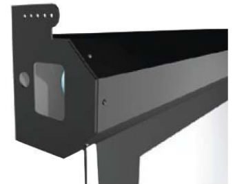
Luxus Model A Classic