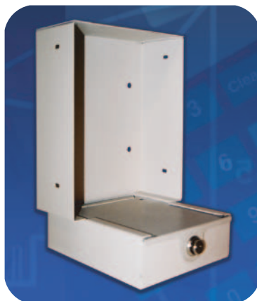
Recessed Wall-Mount Kit for E-Series