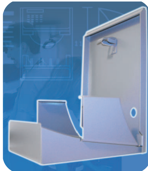
Table-Top Secure Mount for F-Series