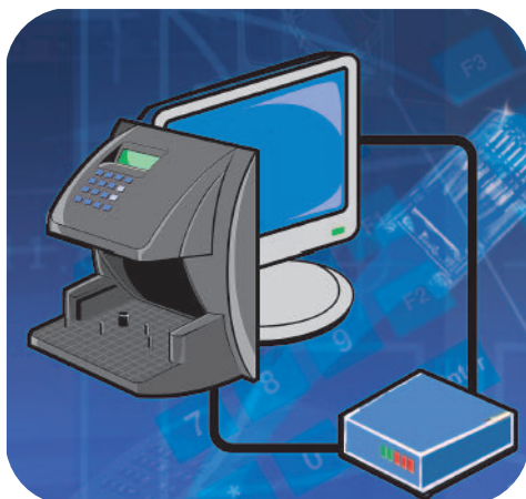
Ethernet Communications Module, 10 Base-T TCP/IP