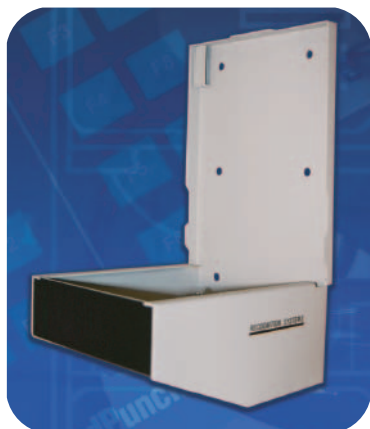
Surface Wall-Mount Kit for E-Series