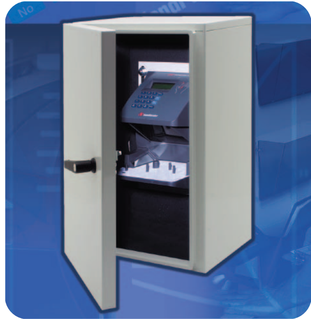
Tsunami Water Tight Enclosure