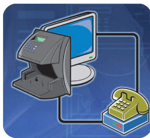
Internal Modem, 14.4K Baud