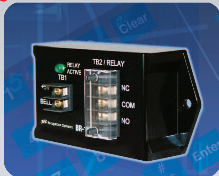
5V HandReader Relay