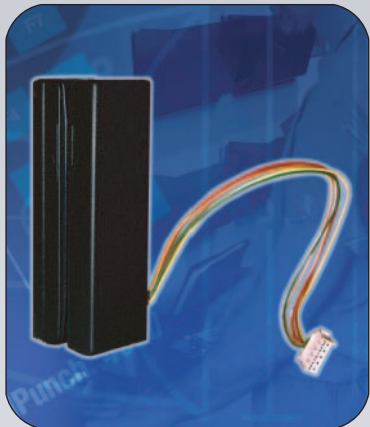
Magnetic Stripe Reader