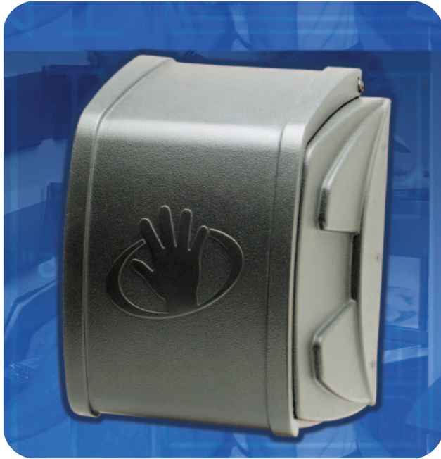
Hurricane Outdoor Enclosure