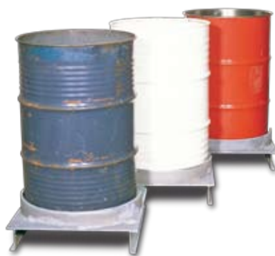
Standard drums can be used for storage and transport of the hazardous waste. By using several drums, sorting is possible.

Compacts hazardous waste, such as glass and cans/tins with paint, oil and other chemical remains directly into drums. With Orwak 5030-N HD the handling, transportation and disposal of chemical waste becomes safe and simple. Operator easily handles the heavy duty steel pallet with standard pallet lifter.