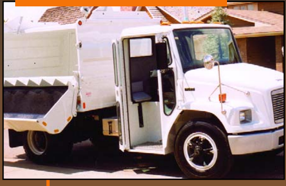
Ideal for routes with frequent stops.