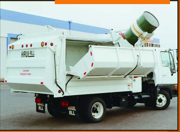
Eliminate lifting of barrels with optional barrel dumper.