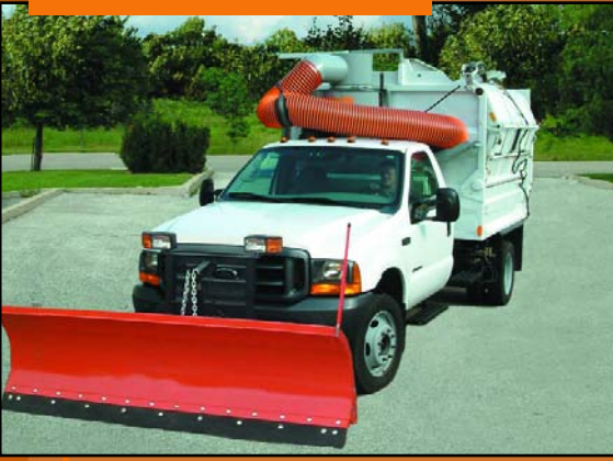
Allows smaller towns to minimize capital expenditures and can be used as a back up for larger communities.