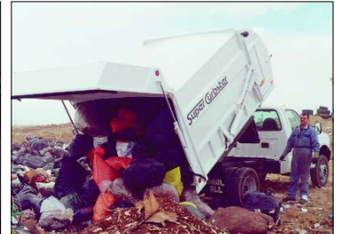
Light weight design maximizes chassis payload capacity.

Liquid & powder paint process achieves a high gloss, durable finish.