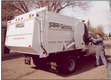
Lowest loading height in its class.