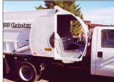
Full width loading hopper minimizes required cycles.