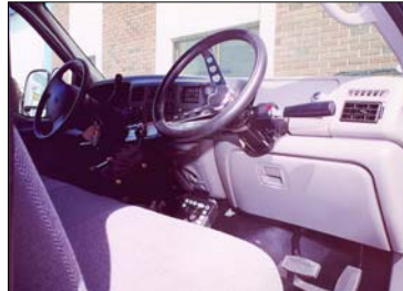
Available with dual steering to collect with the traffic flow. (Ford F550 only)