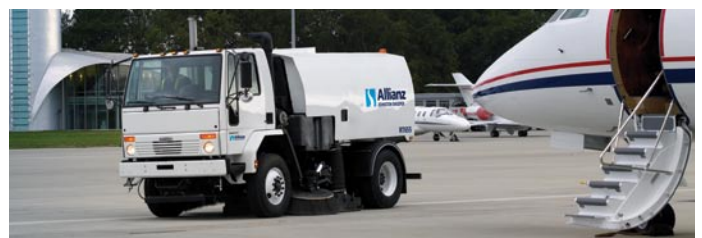
Tightest turning radius in its class.

The RT655 can be mounted on an assortment of Conventional and Cab Over Chassis, allowing users to standardize their fleets. Its compact design permits mounting onto a short 133" (338 cm) wheelbase truck resulting in unrivaled maneuverability.