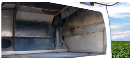
Stainless steel hopper resists corrosion

Allianz Sweeper Company has continually set the standard for debris hopper construction, while backing them with comprehensive warranties that safeguard your investment.