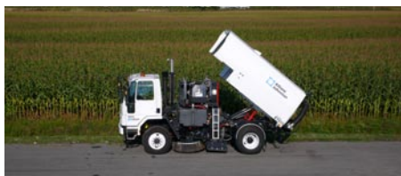
Hopper tips like dump truck-eliminating wear parts

In addition, the dust separator is automatically emptied each time the hopper is tipped eliminating unreliable cables and linkages.