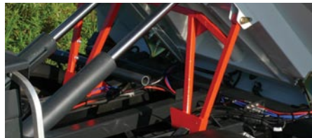
Automatic body prop ensures operator or maintenance personnel safety during equipment inspection.