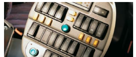
Single touch master control all functions

A single master sweep control 'ergo' switch raises/lowers, stops/starts all sweeping functions. Water can be automatically selected with each broom/ sweeping function, eliminating switches and wires.