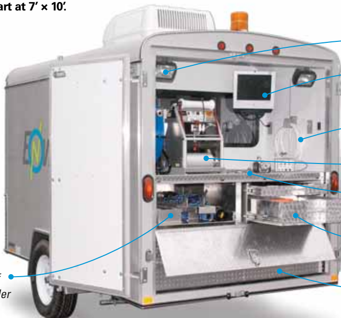
Sliding Shelf Stows Crawler & Wheels.