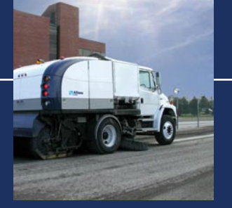
Most comprehensive warranty in the industry