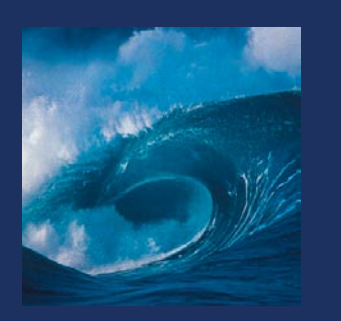
RIGHT Allianz Johnston A cleaner environment for everyone

Allianz Sweeper's commitment to environmental issues is also a key part of our manufacturing philosophy. Recycling, energy efficient processes and a "Green Supplier" policy reduce waste and contribute to a cleaner workplace that is kinder to the environment.