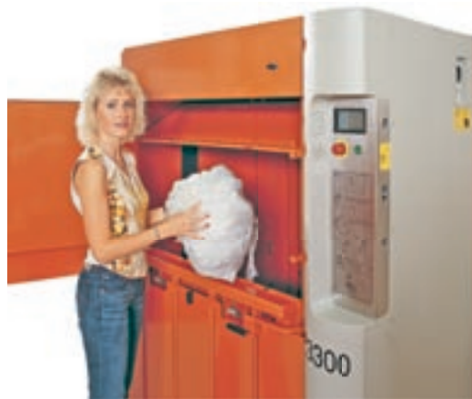
Different types of materials, such as paper or plastics, are easily loaded and compacted.

The Orwak 3300 is the result of over 30 years of experience in the market. Safe and reliable for the operator. Fast and powerful for efficient operation. Easy to handle.