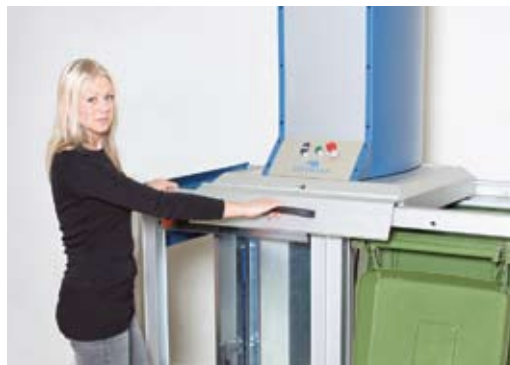
The presshead slides easy over the chambers.

A couple of square metres of floor space are all you need to organize your waste handling. A complete miniature recycling point, where waste can be processed and conveniently sorted for immediate recycling or disposal. Little Elephant compacts into standard bins, bags and bales.