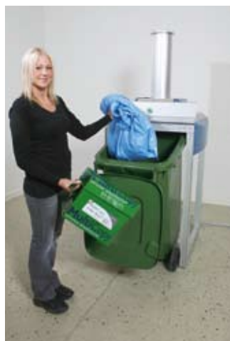
Basic single chamber unit.