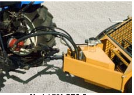
Model 750-PTO Pump