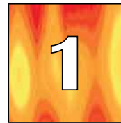
METAL BLOCK BATH