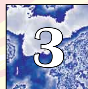
STIRRED ICE / WATER