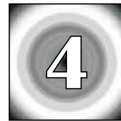
BLACK BODY SOURCE