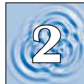
STIRRED LIQUID BATH