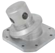
ART-S23 ● ● ●