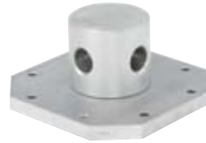
ART-FB ● ● ●