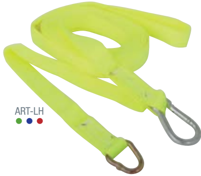
ART-LH ● ● ●