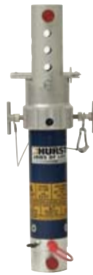
A STRUT ● ● ●