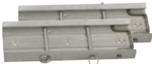
ART-RR18 ● ● ●