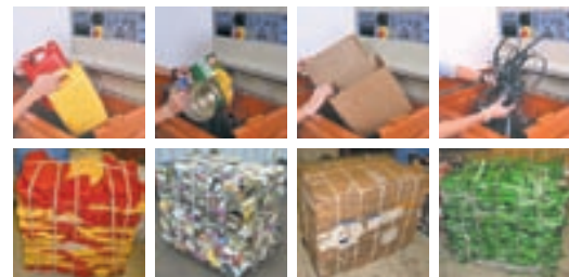
Plastic jugs up to 45 kg* Steel/Tin/ Paint cans up to 80 kg* Cardboard up to 55 kg* Plastic/Steel straps up to 60 kg*