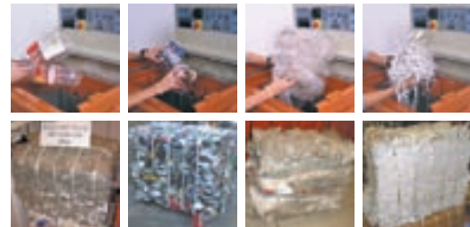
PET-bottles up to 30 kg* Aluminium cans up to 20 kg* Plastic bags shrink films up to 65 kg* Shredded paper up to 50 kg*