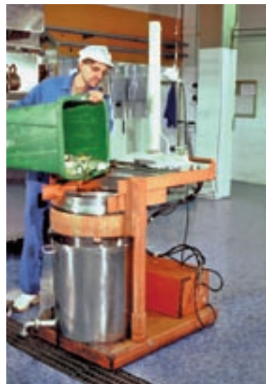
Liquid separation. Critical components made in stainless steel.