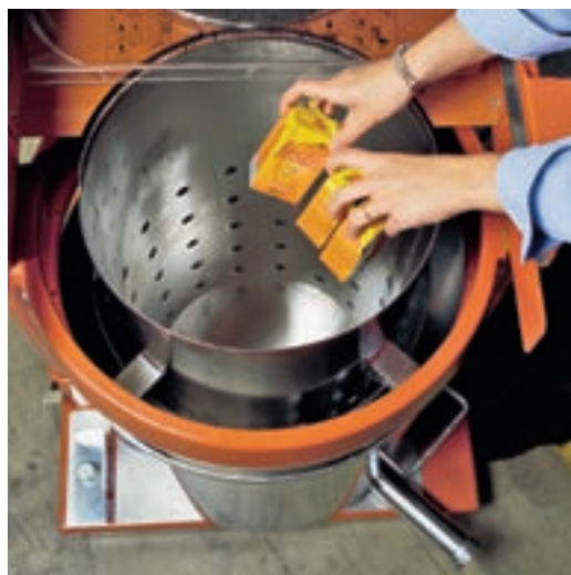
During compaction the liquid continuously drains out of the 2 inch pipe.

Dairies and other perishable food manufacturers sometimes have to reject batches of liquid filled packs. Orwak 5030-CE compacts the packs forcing liquid to drain off from the container.