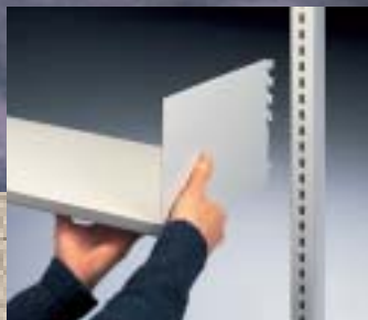
Assembles quickly and easily with a minimum of tools.