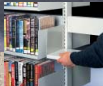
Easily expand and reconfigure to meet your changing needs.