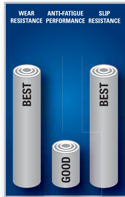
RESULTS from INDEPENDENT TEST LABS & PRESENTED as COMPARISONS to OTHER NoTRAX® INDUSTRIAL MATS