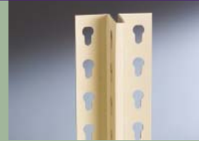
ZTP Intermediate Upright Post