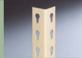
EUR Standard Upright Post