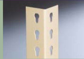
SUR Heavy Upright Post

Post Options Match posts with your needs: Use SUR posts for your most demanding applications. Use EUR for light or medium weight applications and in conjunction with ZTP posts. Use ZTP as an intermediate common "T" post.