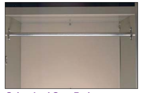
Galvanized Coat Rods

are standard on single, double, triple-tier lockers. Used with built-in key locks, combination locks or coin deposit locks.