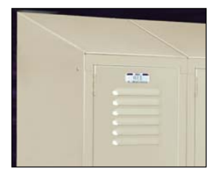
Not designed for use on expanded metal or welded lockers.