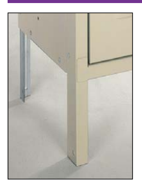
Locker Legs add 6" to overall locker height.