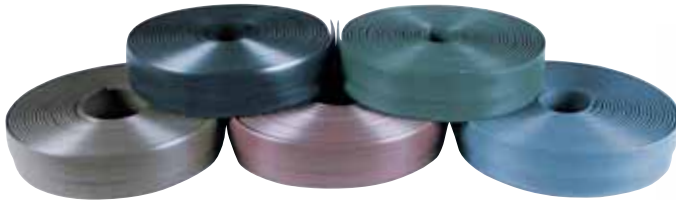
#084 Heavy Duty Beveled Nosing